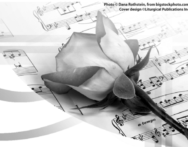
Photo © Dana Rothstein, from bigstockphoto.com Cover design © Liturgical Publications Inc

The LORD, your God, is in your midst, a MIGHTY savior; he will rejoice over you with GLADNESS, and renew you in his love, he will SING joyfully because of you.